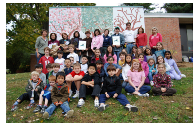
IES outdoor classroom and bird blind.

REF does make a difference in the education of our children.